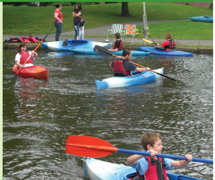
Residents enjoying the kayaking on the canal last year

If you would like to be involved in helping to arrange the Fun Day then please contact us.