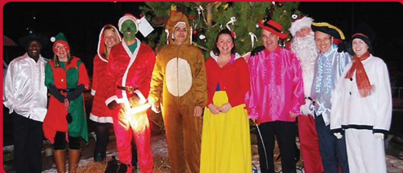
Adactus staff at the Miles Platting Christmas Parade this December

Emergency out of hours telephone number (for emergency repairs and reporting anti-social behaviour) t: 0845 345 7808 .